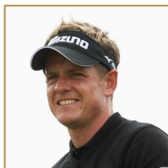
LUKE DONALD Evanston, Ill.