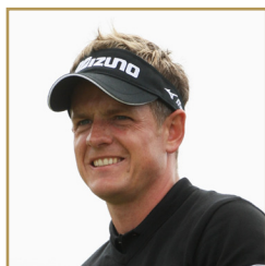
LUKE DONALD Evanston, Ill.

The PGA Player of the Year Award is given to the top PGA Tour player based on his tournament wins, official money standing and scoring average. The point system for selecting the PGA Player of the Year was amended in 1982, and is as follows: 30 points for winning the PGA Championship, U.S. Open, British Open or Masters; 20 points for winning The Players Championship; and 10 points for winning all other designated PGA Tour events. In addition, there is a 50-point bonus for winning two majors, 75-point bonus for winning three, 100-point bonus for winning four. For top 10 finishes on the PGA Tour's official money and scoring average lists for the year, the point value is: first, 20 points, then 18, 16, 14, 12, 10, 8, 6, 4, 2. Any incomplete rounds in the scoring average list will result in a .10 penalty per incomplete round.