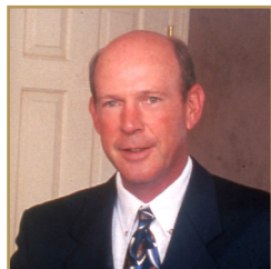
LARRY NELSON Marietta, Ga.

Inaugurated in 1988, the PGA Distinguished Service Award honors outstanding individuals who display leadership and humanitarian qualities, including integrity, sportsmanship and enthusiasm for the game of golf. It is The PGA of America's highest annual honor.