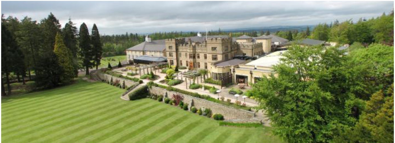
Slaley Hall in Northumberland, England